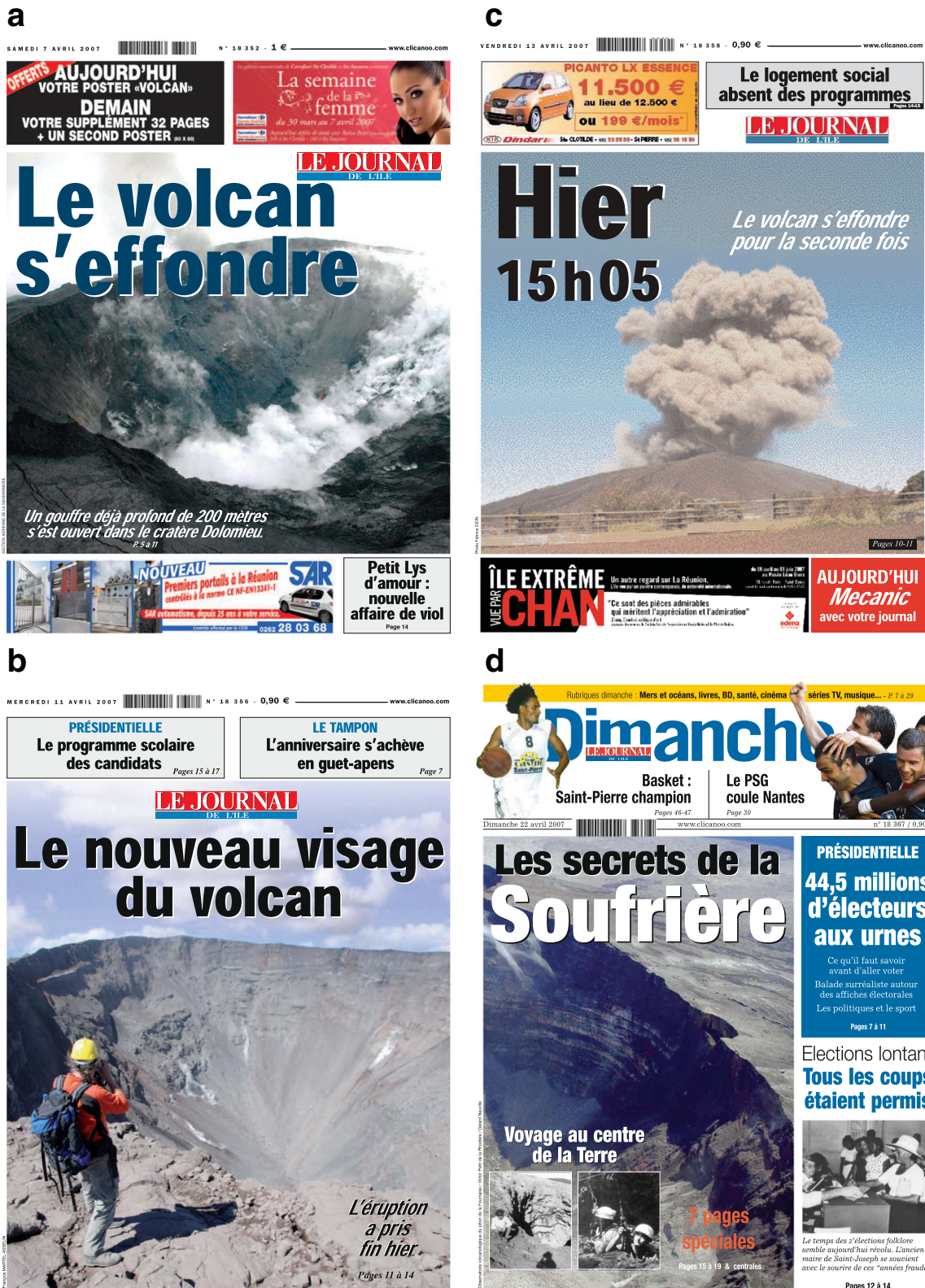
Fig. 10 Front pages of JIR featuring pit-crater collapse published on (a) 7 April 2007 (N° 18352), (b) 11 April 2007 (N° 18356), (c) 13 April 2007 (N° 18358), and (d) 22 April 2007 (N° 18367)