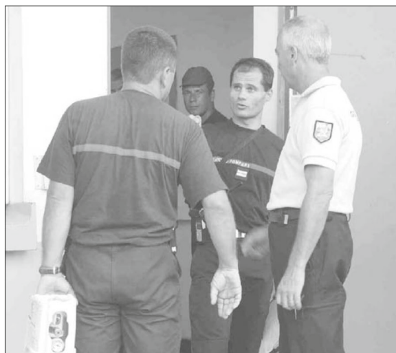
Pas moins de vingt-cinq pompiers de tout le Sud ont été mobilisés sur ce phénomène très localisé à Saint-Joseph.