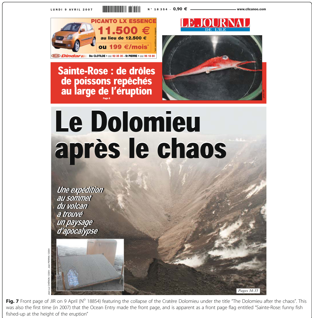
Fig. 7 Front page of JIR on 9 April (N° 18854) featuring the collapse of the Cratère Dolomieu under the title “The Dolomieu after the chaos”. This was also the first time (in 2007) that the Ocean Entry made the front page, and is apparent as a front page flag entitled “Sainte-Rose: funny fish fished-up at the height of the eruption”

entry on 3 and 4 April, respectively. Focus then switched to gas and air fall on 5 and 6 April, respectively, before becoming entirely focused on the collapse of the Dolomieu (on 7, 9, 11, 13 and 22 April). This was in spite of the fact that the main collapse occurred on 6–7 April, but ocean entry and lava flow continued throughout the eruption. The threat of lava flow invasion to Le Tremblet only became a focus again on the final front page that featured the eruption, that of 27 April, when the eruption had more-or-less ended. Thus, the reporting of hazard followed the primary