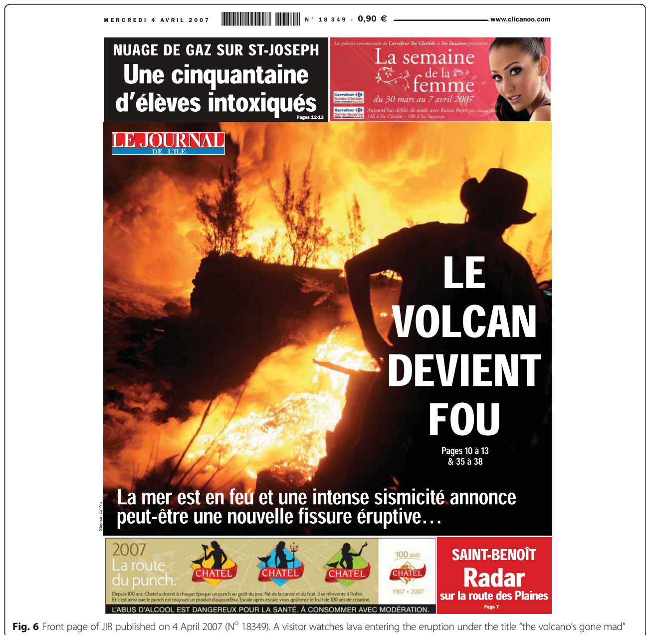
Fig. 6 Front page of JAV published on 4 April 2007 (N° 18349). A visitor watches lava entering the eruption under the title “the volcano’s gone mad”

featured most highly, being the main theme of six of the front page articles. Next was lava (five front page appearances), followed by gas and ocean entry hazards (two appearances), with seismic, ash and evacuation themes featuring on the front page just once (Table 1). However, if we complete a word count on all words appearing in all front page headlines of Table 1, we instead have the following ranking: