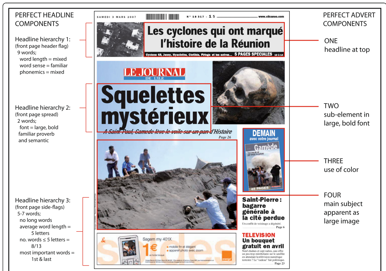
Fig. 4 Front page of JIR on 3 March 2007 (N° 18317) illustrating the perfect format for headline writing and front page layout if recall using the short-term memory is to be maximized. The newspaper was devoted to follow-up of the passage of cyclone Gamède which passed within 250 km of the island of La Réunion on 24 February 2007, and then again on 27–28 February 2007; the front page header reading “The cyclones which have marked the history of La Réunion”. The front page spread and imagery is devoted to the “mysterious skeletons” which were unearthed due to coastal erosion during the passage of Gamède

It is also well-known that human-beings have a “vast memory” for pictures (Standing et al. 1972; Standing 1973), so that image-based messages can be much more memorable than textually or verbally delivered messages (Paivio and Caspo 1973). Effective message delivery can thus be achieved through just a momentary glance at an image (Standing et al. 1972), with images containing a concealed object (or obscured object) being just as effective for mnemonic purposes as one in which all objects are pictured, although the latter is certainly a much more vivid communication means (Neisser and Kerr 1973). Use of appropriate imagery is also an effective communication device to enhance learning (Dutrow 2007). Carney and Levin (2002) thus argued that “whether ancient cave painting or computer screen icon, pictures are part of